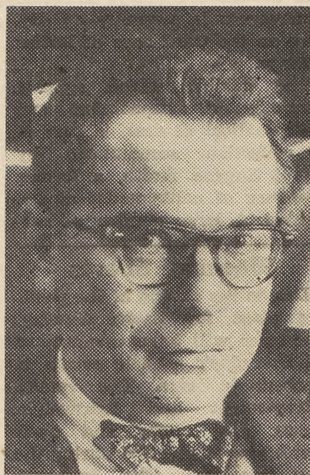
Professor Richard Hofstadter

Professor Hofstadter's three public lectures will be on the theme of his new book. He will