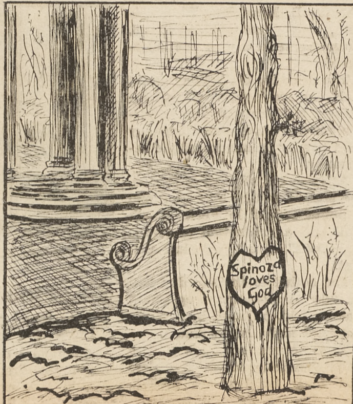
Springtime on the Quad